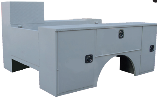
C-Series and G-Series Crane Bodies