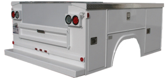
T-Series Top Opening Bodies