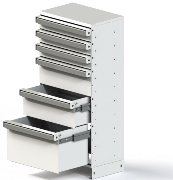
Product shown: BDS24N321