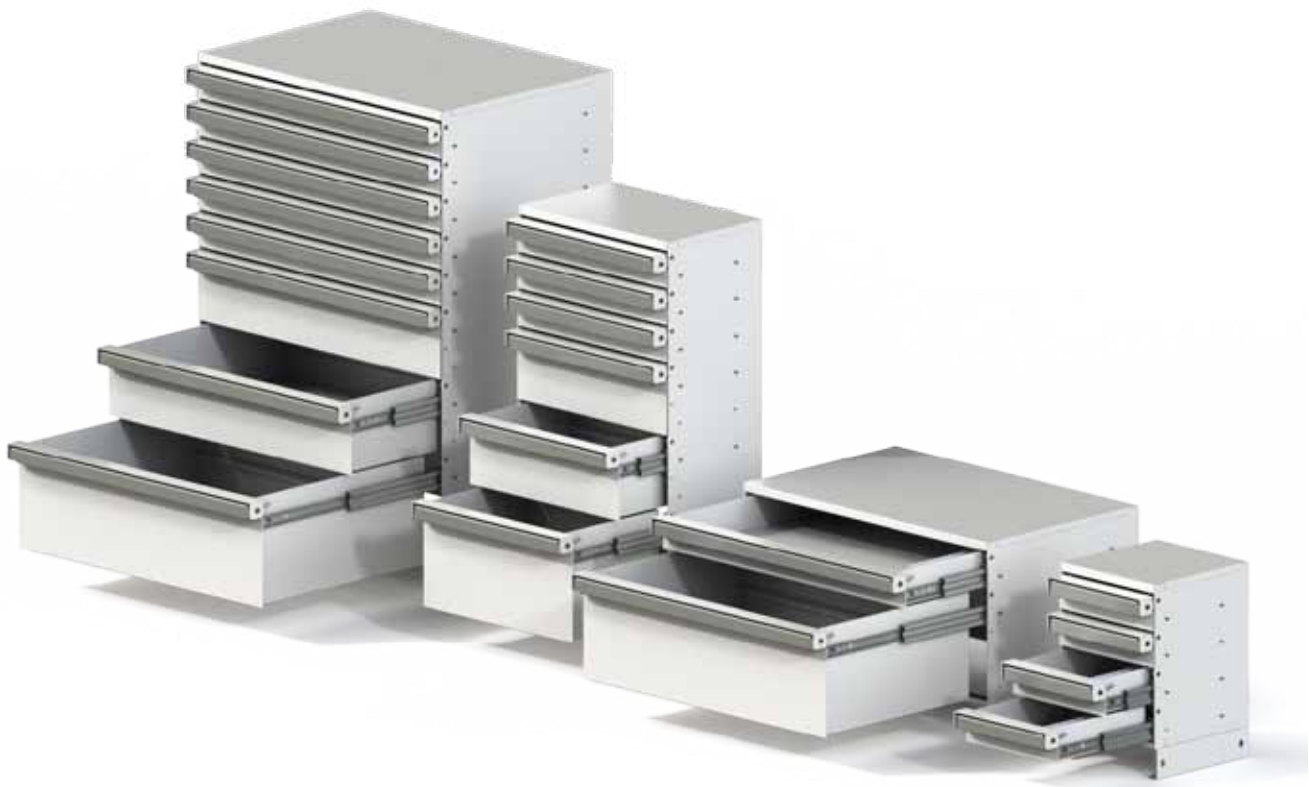
Products shown (left to right): BDS34X521, BDS24N321, BDS34W101, BDS18N400

See "Drawer System Fit" bulletin P3145 to determine the system for a specific compartment and for all available combinations.